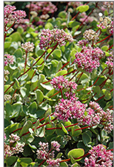
October Daphne flowers