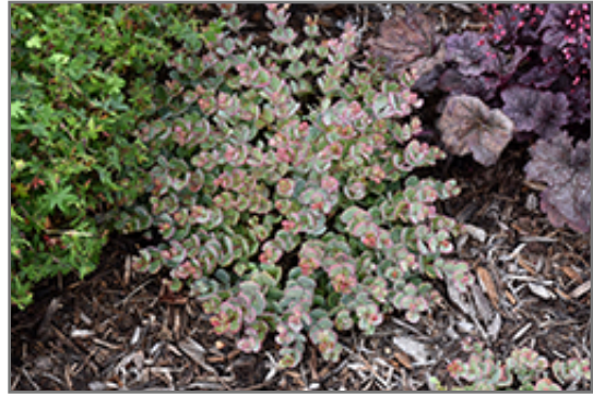
October Daphne