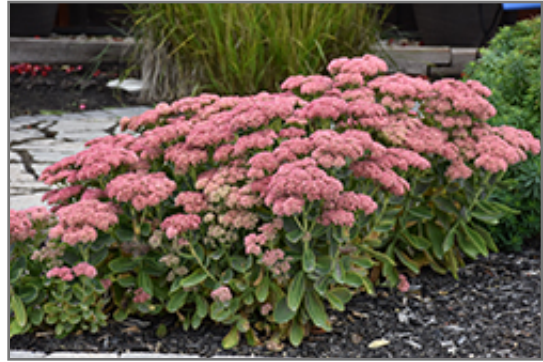
Autumn Fire Stonecrop in bloom

Autumn Fire Stonecrop is recommended for the following landscape applications;