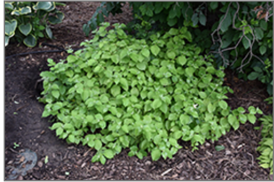
Arctic Sun Dogwood