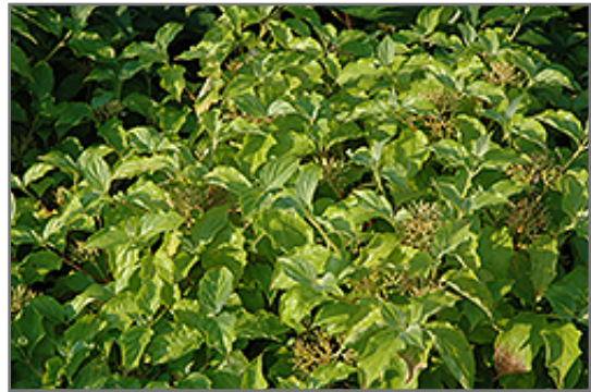
Arctic Sun Dogwood foliage