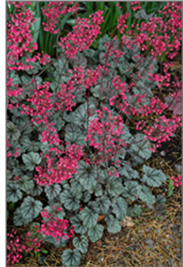
Rave On Coral Bells in bloom

Rave On Coral Bells is recommended for the following landscape applications;