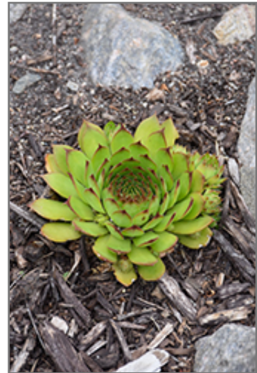
Sunset Hens And Chicks