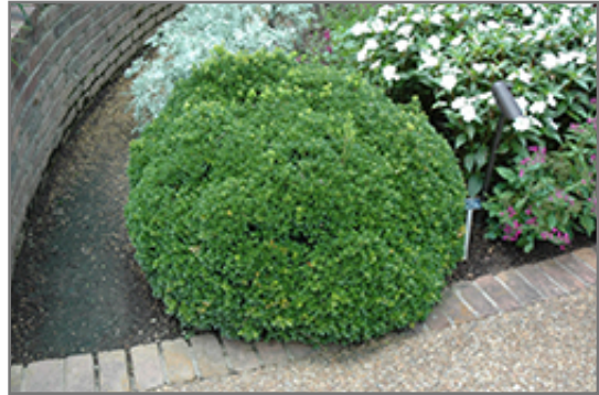
Compact Korean Boxwood

Compact Korean Boxwood is recommended for the following landscape applications;