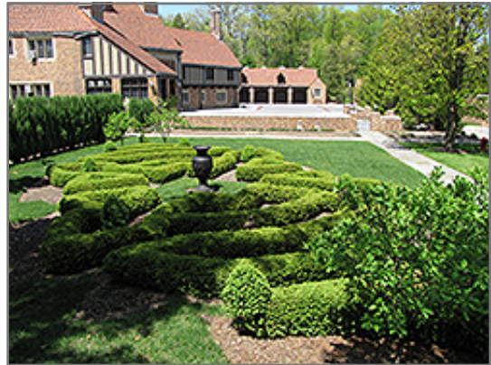
Compact Korean Boxwood

Compact Korean Boxwood will grow to be about 12 inches tall at maturity, with a spread of 12 inches. It tends to fill out right to the ground and therefore doesn't necessarily require facer plants in front. It grows at a slow rate, and under ideal conditions can be expected to live for approximately 30 years.