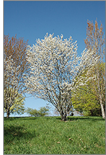
Princess Diana Serviceberry in bloom