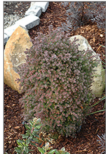
Red Star Whitecedar