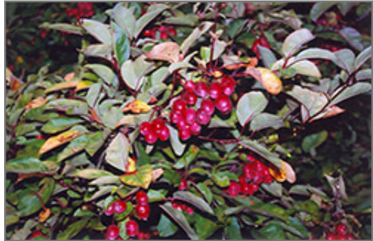
Adams Flowering Crab fruit

* This is a 'special order' plant - contact store for details