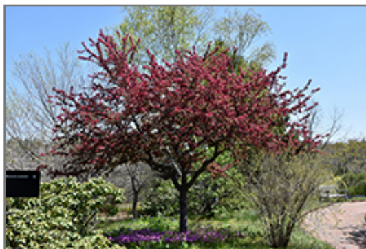
Adams Flowering Crab in bloom

Adams Flowering Crab is recommended for the following landscape applications;