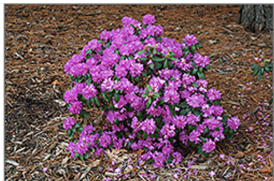
Compact P.J.M. Rhododendron in bloom