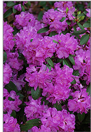
Compact P.J.M. Rhododendron flowers

Compact P.J.M. Rhododendron is recommended for the following landscape applications;