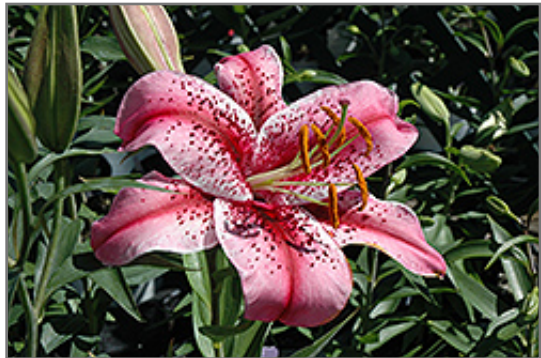
Tiger Edition Lily flowers