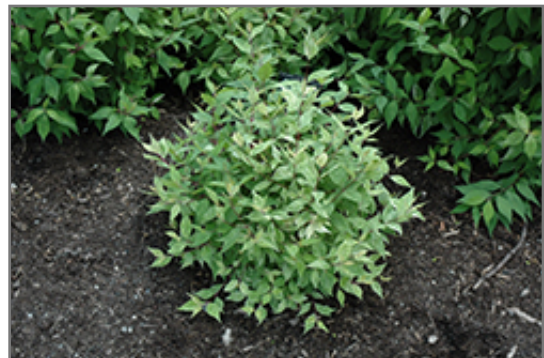
Snow Storm Japanese Beautyberry