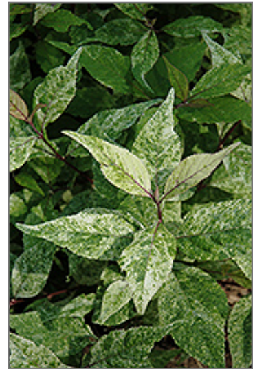
Snow Storm Japanese Beautyberry foliage