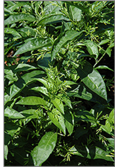
Night Blooming Jessamine flowers