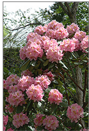
Scintillation Rhododendron flowers