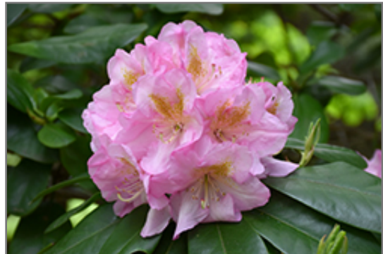
Scintillation Rhododendron flowers