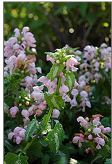
Shell Pink Spotted Dead Nettle flowers