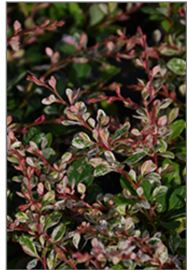
Sunjoy Sequins Japanese Barberry foliage

Sunjoy Sequins Japanese Barberry will grow to be about 3 feet tall at maturity, with a spread of 4 feet. It tends to fill out right to the ground and therefore doesn't necessarily require facer plants in front. It grows at a medium rate, and under ideal conditions can be expected to live for approximately 20 years.