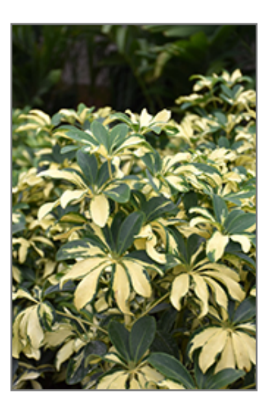
Gold Capella Schefflera foliage

When grown indoors, Gold Capella Schefflera can be expected to grow to be about 5 feet tall at maturity, with a spread of 3 feet. It grows at a medium rate, and under ideal conditions can be expected to live for approximately 10 years. This houseplant performs well in both bright or indirect sunlight and strong artificial light, and can therefore be situated in almost any well-lit room or location. It prefers to grow in average to moist soil. The surface of the soil shouldn't be allowed to dry out completely, and so you should expect to water this plant once and possibly even twice each week. Be aware that your particular watering schedule may vary depending on its location in the room, the pot size, plant size and other conditions; if in doubt, ask one of our experts in the store for advice. It is not particular as to soil type or pH; an average potting soil should work just fine. Be warned that parts of this plant are known to be toxic to humans and animals, so special care should be exercised if growing it around children and pets.