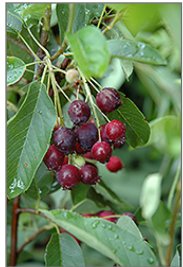
Regent Saskatoon fruit

Regent Saskatoon is blanketed in stunning clusters of white flowers rising above the foliage from early to mid spring before the leaves. It has dark green deciduous foliage. The oval leaves turn an outstanding yellow in the fall. It features an abundance of magnificent blue berries from late spring to early summer.