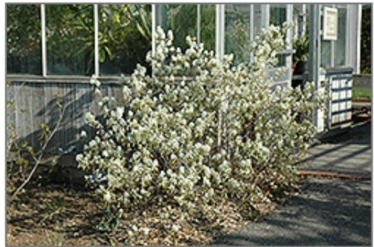
Regent Saskatoon flowers