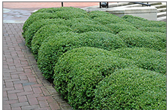
Chicagoland Green Boxwood