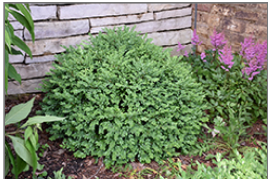
Chicagoland Green Boxwood