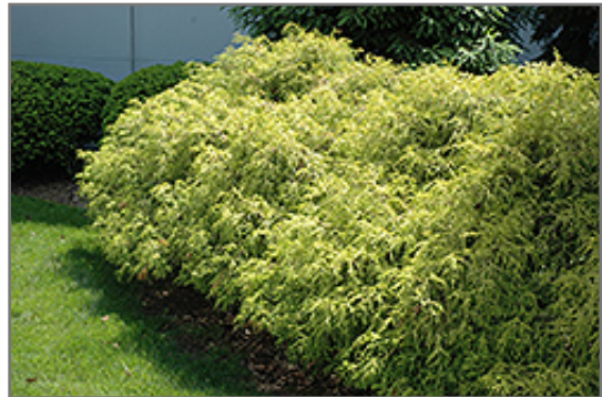
Dwarf Golden Sawara Falsecypress

Dwarf Golden Sawara Falsecypress is recommended for the following landscape applications;