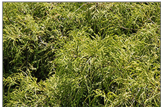
Dwarf Golden Sawara Falsecypress foliage