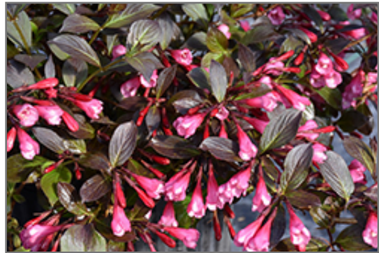
Very Fine Wine Weigela flowers