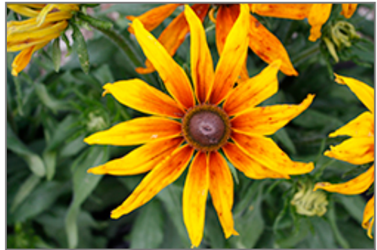
Summerina Sunchaser Echibeckia flowers