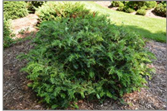
Fritz Huber Plum Yew