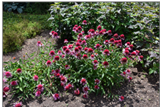
Double Scoop Bubble Gum Coneflower in bloom