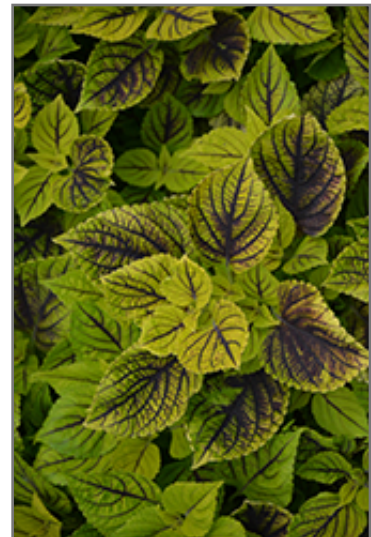
Gays Delight Coleus foliage