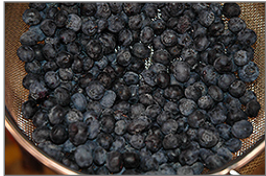
Brigitta Blueberry fruit

Brigitta Blueberry features dainty clusters of white bell-shaped flowers with shell pink overtones hanging below the branches in mid spring. It has green deciduous foliage which emerges coppery-bronze in spring. The glossy oval leaves turn an outstanding burgundy in the fall. It features an abundance of magnificent blue berries from mid to late summer. The smooth yellow bark adds an interesting dimension to the landscape.