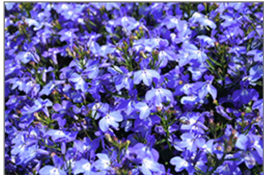
Techno Light Blue Lobelia flowers

Techno Light Blue Lobelia is recommended for the following landscape applications;