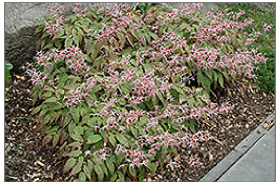
Pink Champagne Fairy Wings in bloom