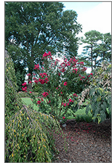
Pink Velour Crapemyrtle in bloom