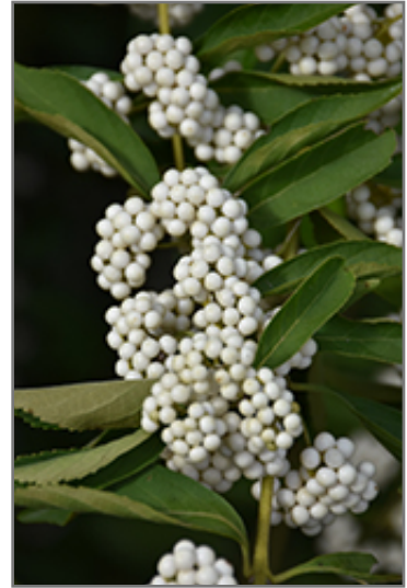
White Beautyberry fruit

White Beautyberry makes a fine choice for the outdoor landscape, but it is also well-suited for use in outdoor pots and containers. Because of its height, it is often used as a 'thriller' in the 'spiller-thriller-filler' container combination; plant it near the center of the pot, surrounded by smaller plants and those that spill over the edges. It is even sizeable enough that it can be grown alone in a suitable container. Note that when grown in a container, it may not perform exactly as indicated on the tag - this is to be expected. Also note that when growing plants in outdoor containers and baskets, they may require more frequent waterings than they would in the yard or garden.