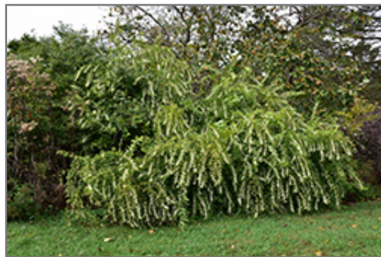
White Beautyberry fruit