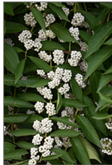
White Beautyberry fruit

White Beautyberry is recommended for the following landscape applications;