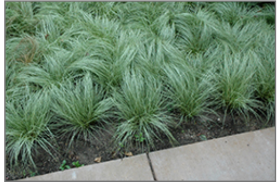
Amazon Mist Sedge