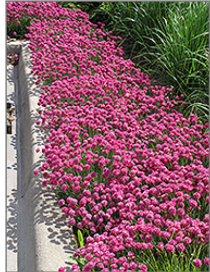
Dusseldorf Pride Sea Thrift in bloom

Dusseldorf Pride Sea Thrift is recommended for the following landscape applications;