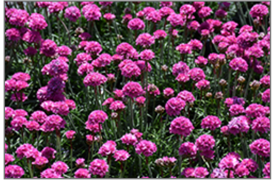
Dusseldorf Pride Sea Thrift flowers

Dusseldorf Pride Sea Thrift will grow to be only 6 inches tall at maturity extending to 8 inches tall with the flowers, with a spread of 8 inches. Its foliage tends to remain low and dense right to the ground. It grows at a slow rate, and under ideal conditions can be expected to live for approximately 10 years. As an evergreen perennial, this plant will typically keep its form and foliage year-round.