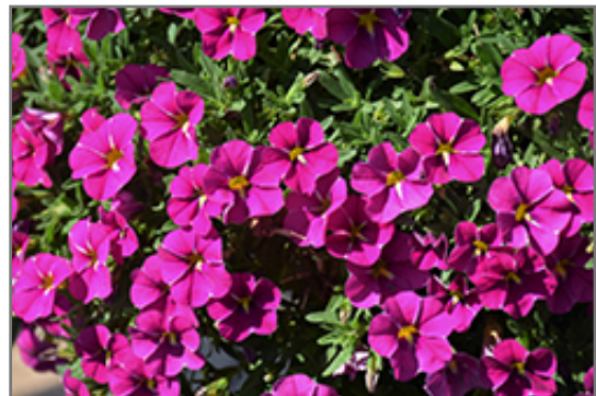
Cabaret Pink Star Calibrachoa flowers