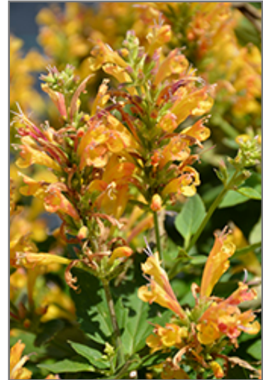
Poquito Butter Yellow Hyssop flowers

Poquito Butter Yellow Hyssop is recommended for the following landscape applications;