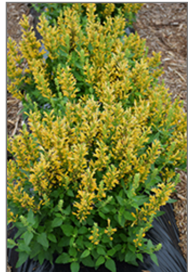
Poquito Butter Yellow Hyssop in bloom