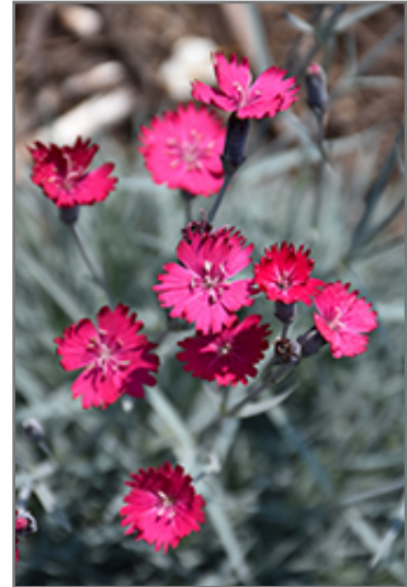
Wicked Witch Pinks flowers

Wicked Witch Pinks is recommended for the following landscape applications;