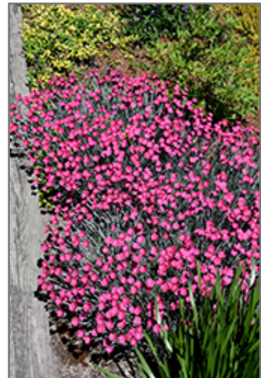
Wicked Witch Pinks in bloom