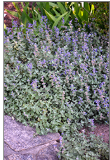
Early Bird Catmint in bloom