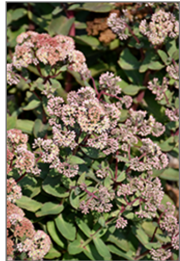
Moonlight Serenade Stonecrop flowers

An upright stonecrop producing large clusters of peach blooms, from deep rose buds; blue-green new foliage matures to purple over time; a drought-tolerant perennial that does best in poor soils, an excellent choice for late summer color in the garden