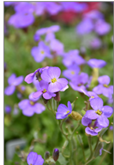
Cascade Blue Rock Cress flowers