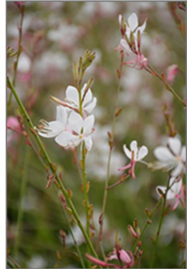
Summer Breeze Gaura flowers

Summer Breeze Gaura is recommended for the following landscape applications;