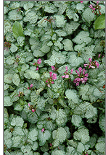
Beacon Silver Spotted Dead Nettle flowers