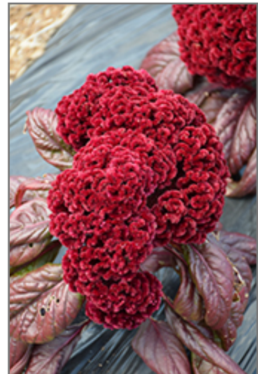
Dracula Celosia flowers