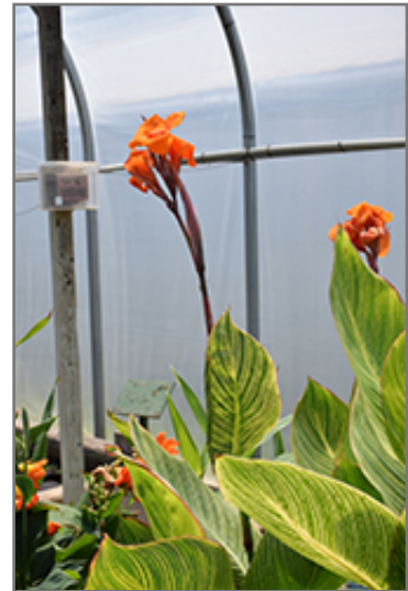
Bengal Tiger Canna flowers

This plant should only be grown in full sunlight. It requires an evenly moist well-drained soil for optimal growth, but will die in standing water. It is not particular as to soil pH, but grows best in rich soils. It is highly tolerant of urban pollution and will even thrive in inner city environments, and will benefit from being planted in a relatively sheltered location. Consider applying a thick mulch around the root zone in winter to protect it in exposed locations or colder microclimates. This particular variety is an interspecific hybrid. It can be propagated by division; however, as a cultivated variety, be aware that it may be subject to certain restrictions or prohibitions on propagation.