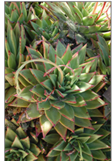
Molded Wax Echeveria foliage