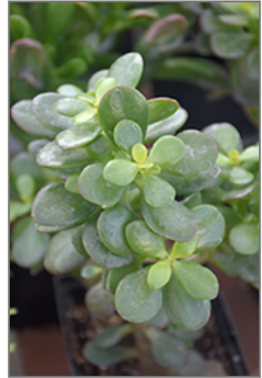
Baby Jade Plant foliage

This is a multi-stemmed evergreen houseplant with an upright spreading habit of growth. This plant can be pruned at any time to keep it looking its best.