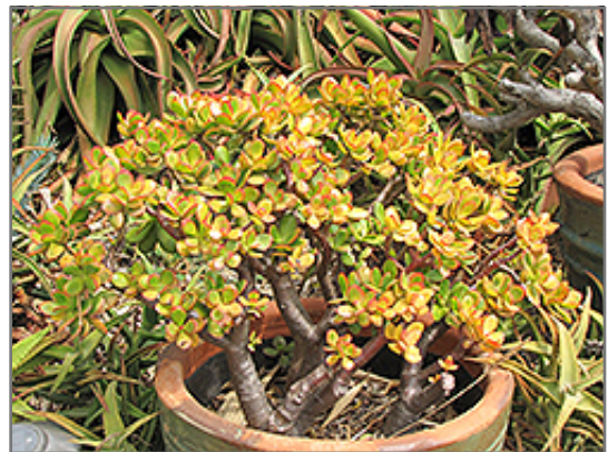
Sunset Jade Plant