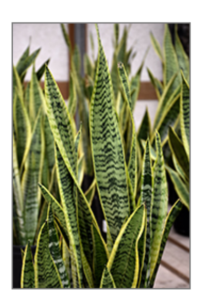
Futura Superba Snake Plant foliage

When grown indoors, Futura Superba Snake Plant can be expected to grow to be about 18 inches tall at maturity, with a spread of 12 inches. It grows at a slow rate, and under ideal conditions can be expected to live for approximately 10 years. This houseplant performs well in both bright or indirect sunlight and strong artificial light, and can therefore be situated in almost any well-lit room or location. It is very adaptable to both dry and moist soil, and should do just fine under average home conditions. The surface of the soil shouldn't be allowed to dry out completely, and so you should expect to water this plant once and possibly even twice each week. Be aware that your particular watering schedule may vary depending on its location in the room, the pot size, plant size and other conditions; if in doubt, ask one of our experts in the store for advice. It is not particular as to soil pH, but grows best in sandy soil. Contact the store for specific recommendations on pre-mixed potting soil for this plant. Be warned that parts of this plant are known to be toxic to humans and animals, so special care should be exercised if growing it around children and pets.