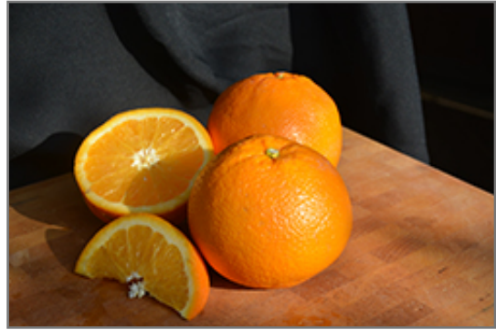
Navel Orange fruit

When grown indoors, Navel Orange can be expected to grow to be about 8 feet tall at maturity, with a spread of 5 feet. It grows at a medium rate, and under ideal conditions can be expected to live for approximately 50 years. This houseplant will do well in a location that gets either direct or indirect sunlight, although it will usually require a more brightly-lit environment than what artificial indoor lighting alone can provide. It does best in average to evenly moist soil, but will not tolerate standing water. The surface of the soil shouldn't be allowed to dry out completely, and so you should expect to water this plant once and possibly even twice each week. Be aware that your particular watering schedule may vary depending on its location in the room, the pot size, plant size and other conditions; if in doubt, ask one of our experts in the store for advice. It is not particular as to soil type or pH; an average potting soil should work just fine.