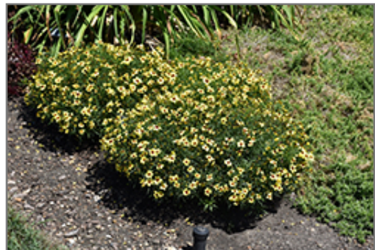
Sizzle And Spice Sassy Saffron Tickseed in bloom