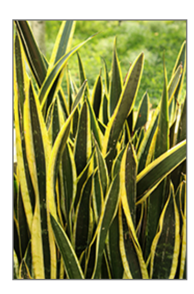
Black Gold Snake Plant foliage

When grown indoors, Black Gold Snake Plant can be expected to grow to be about 3 feet tall at maturity, with a spread of 12 inches. It grows at a slow rate, and under ideal conditions can be expected to live for approximately 10 years. This houseplant performs well in both bright or indirect sunlight and strong artificial light, and can therefore be situated in almost any well-lit room or location. It is very adaptable to both dry and moist soil, but will not tolerate any standing water. The surface of the soil shouldn't be allowed to dry out completely, and so you should expect to water this plant once and possibly even twice each week. Be aware that your particular watering schedule may vary depending on its location in the room, the pot size, plant size and other conditions; if in doubt, ask one of our experts in the store for advice. It will benefit from a regular feeding with a general-purpose fertilizer with every second or third watering. It is not particular as to soil pH, but grows best in sandy soil. Contact the store for specific recommendations on pre-mixed potting soil for this plant.