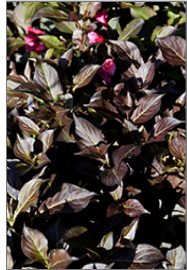
Midnight Wine Shine Weigela foliage